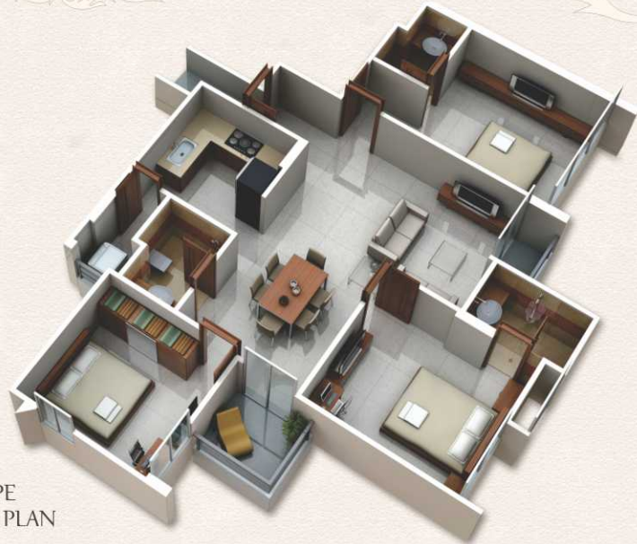
B - TYPE 3D FLOOR PLAN