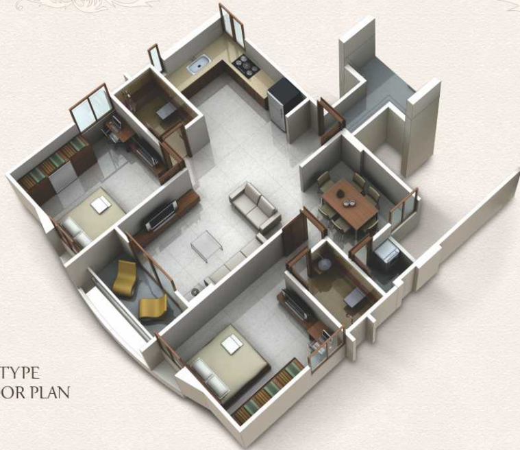
A - TYPE 3D FLOOR PLAN